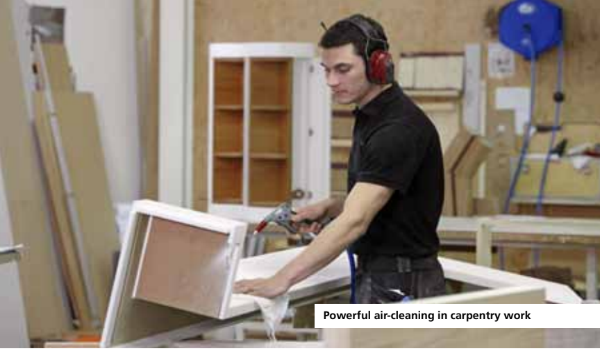
Powerful air-cleaning in carpentry work