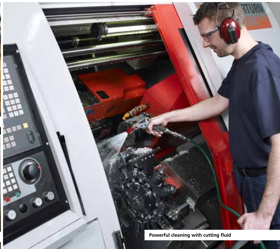
Powerful cleaning with cutting fluid