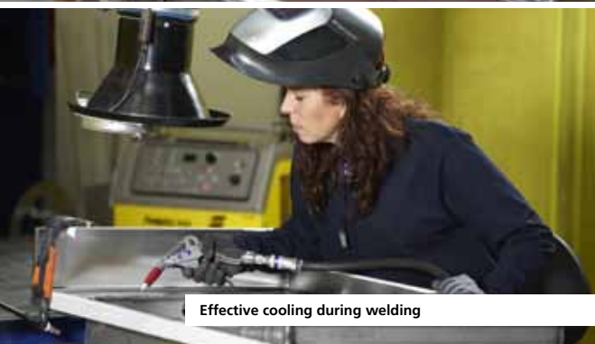
Effective cooling during welding