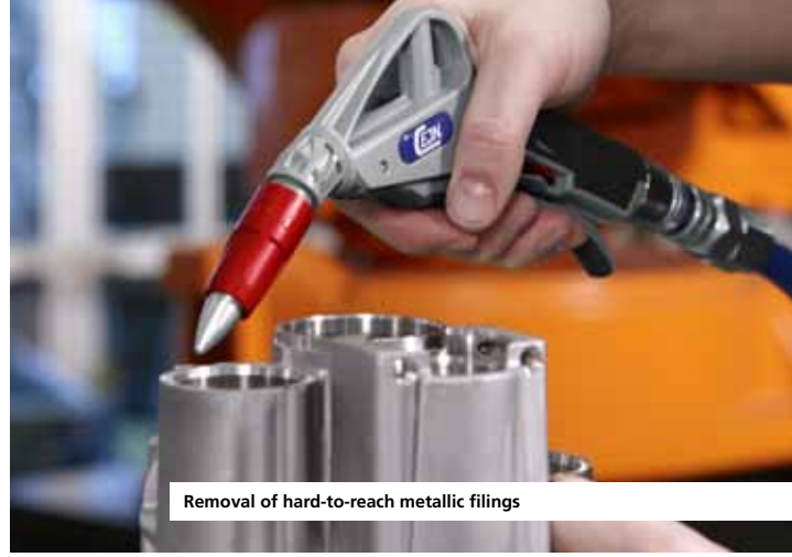
Removal of hard-to-reach metallic filings