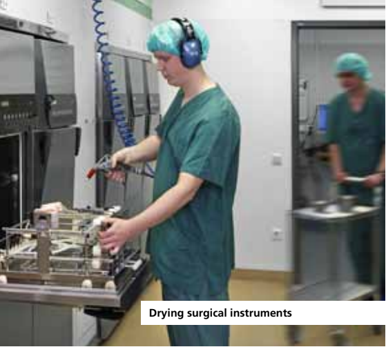
Drying surgical instruments