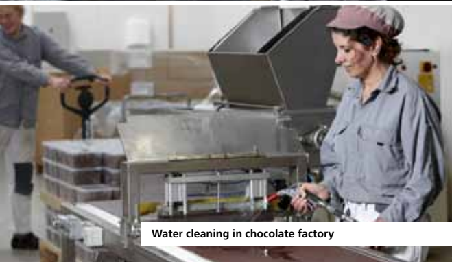
Water cleaning in chocolate factory