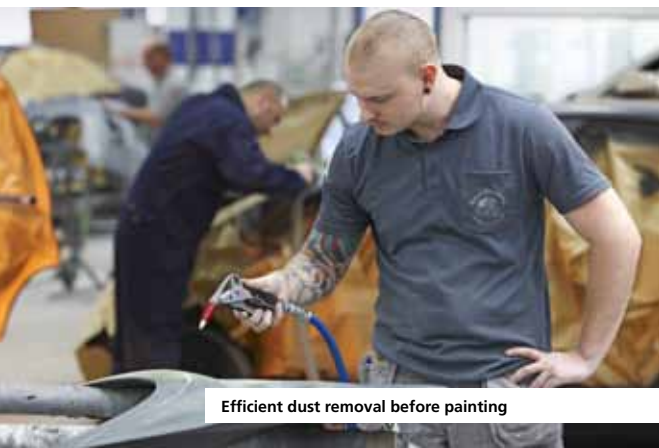
Efficient dust removal before painting