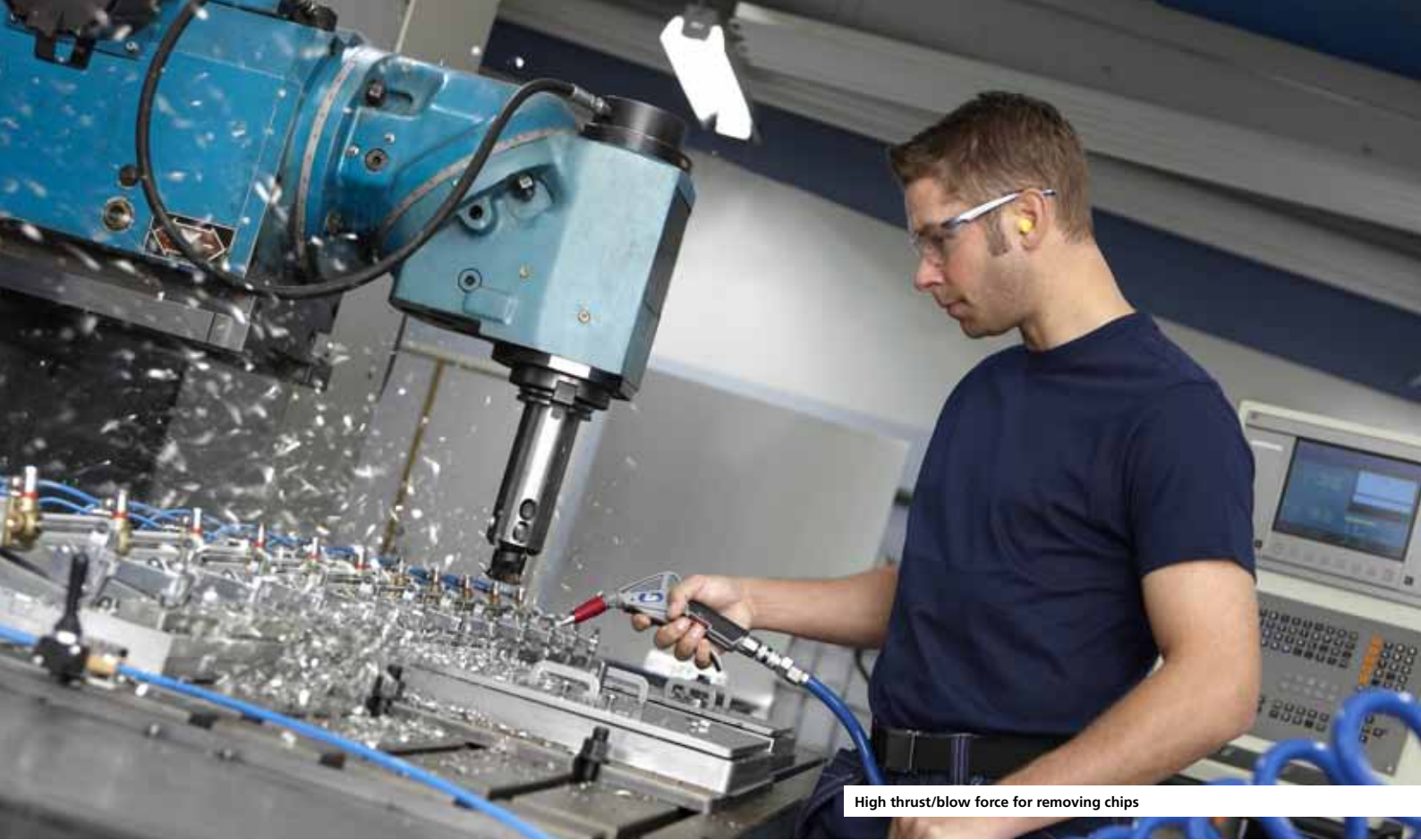
High thrust/blow force for removing chips