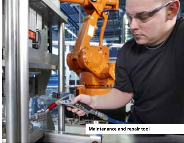
Maintenance and repair tool