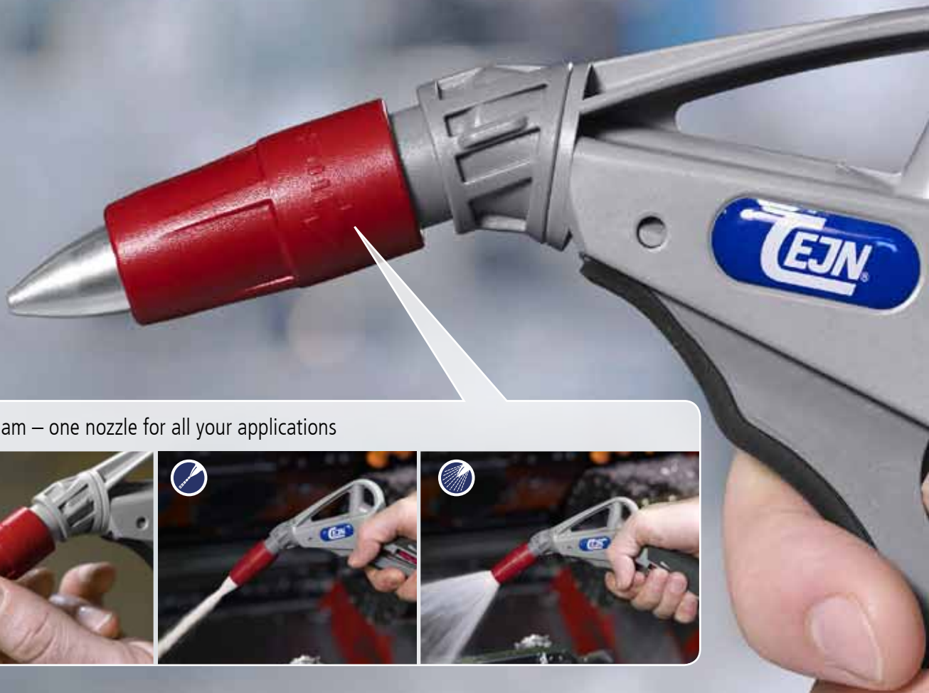
Adjustable beam – one nozzle for all your applications