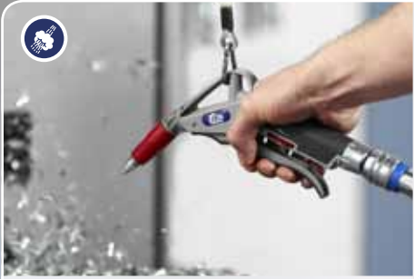
Air and fluid flow